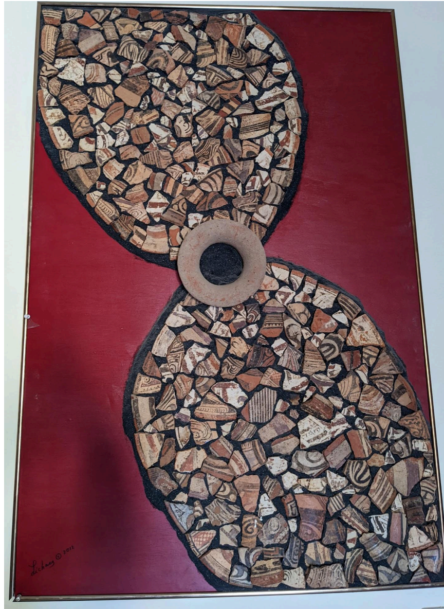
Clay wine jug fragment art, The Wedding Church, Kfar Kanna, Israel